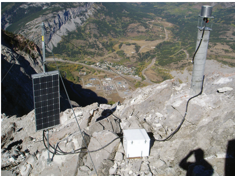
An antenna mounted on a cast concrete column at a mountain top installation.

3DTracker-LT is a powerful solution for monitoring the movement and deformation of large natural and manmade structures. Typical applications include landslides, mines, buildings, bridges, dams and volcanoes. 3D Tracker-LT processes signals to both the GPS and GLONASS satellite constellations, which together comprise the Global Navigation Satellite System (GNSS.)