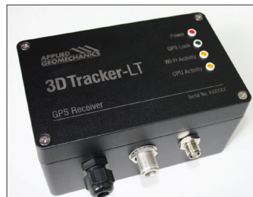
3D Tracker-LT L1 GPS + GLONASS receiver.