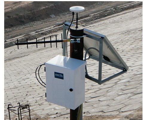
A standard pole mounted installation on a Hydro dam.

The 3D Tracker-LT receiver, Wi-Fi radio, and associated electronics are housed in a rugged NEMA 4X enclosure and are fully protected against environmental extremes. AGI's monitoring