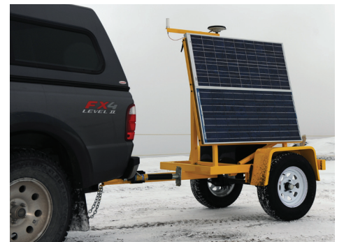
A mobile installation for short-term monitoring.

capabilities include a variety of permanent and mobile monument designs that are suitable for a broad range of project conditions.