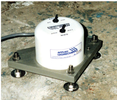
Model 711-2 Floor Mount Tiltmeter

The internal electronics of Models 711-2 and 716-2 will drive cable lengths of 1000m. These tiltmeters are widely used for structural monitoring, load testing, and precision alignment of antennae and machinery.