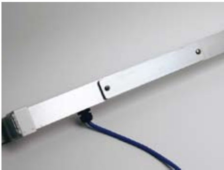
All Beamers include their own signal conditioning electronics.