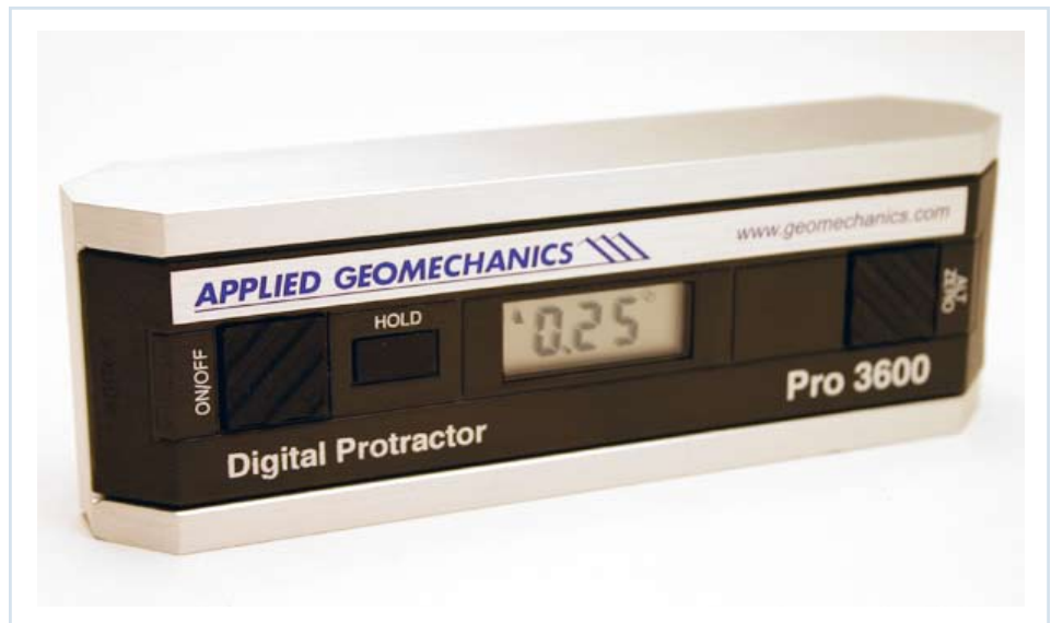
Pro 3600 Digital Protractor

at the top and bottom surfaces of the instrument. The top and bottom surfaces are parallel to within ±0.005 inch (±0.1mm). A V-groove runs the length of the bottom surface for easy placement on curved surfaces such as pipes or tubes. There are two threaded mounting holes in the bottom of the Pro 3600 for fastening to a mounting surface with screws.