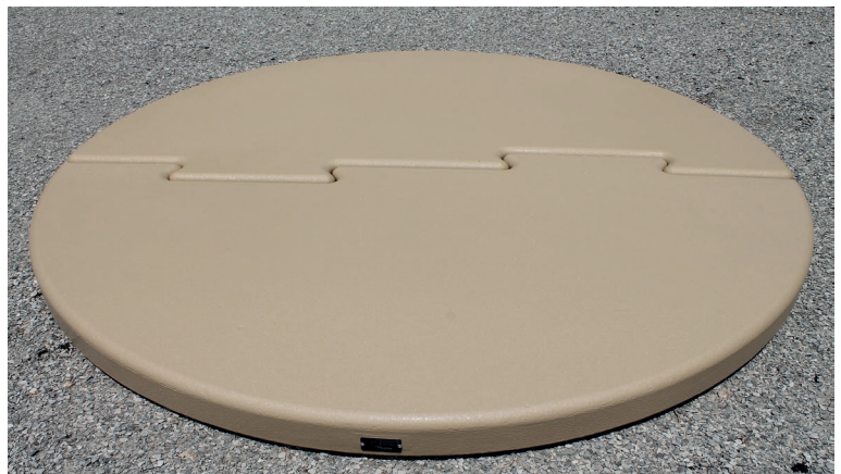
Flat bottom interlocking tank base

The unique interlocking design requires no tools to install. Typically, unpacking and installing a tank base takes no more than 5 minutes. Its light weight easily allows small adjustments just before tank setting, which reduces the need for crane adjustments.